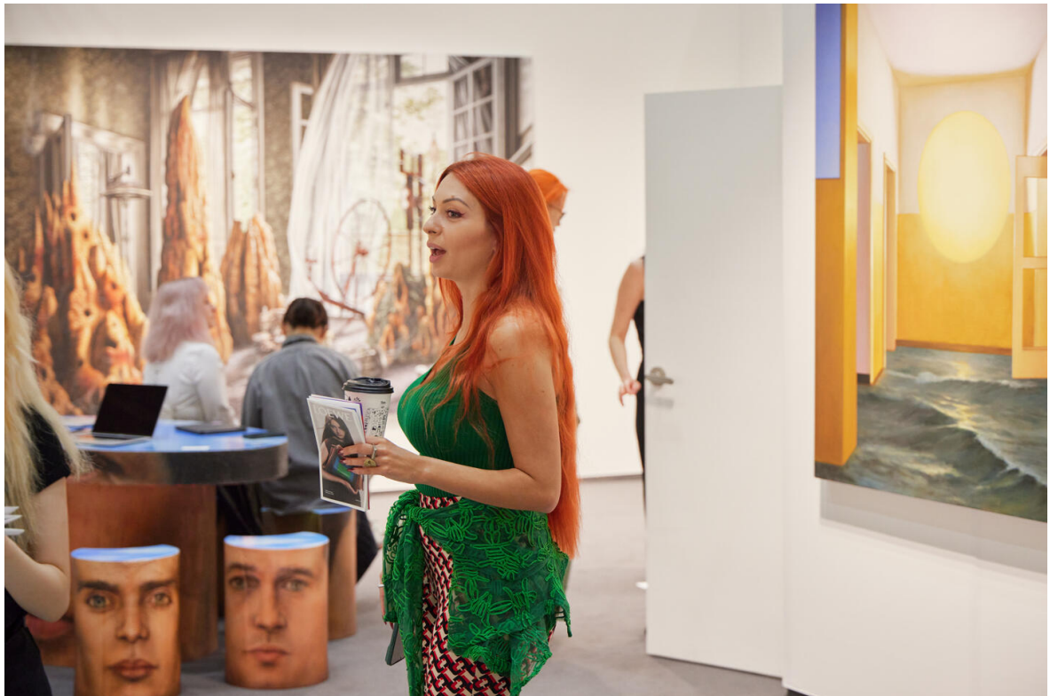
Frieze Seoul 2025.