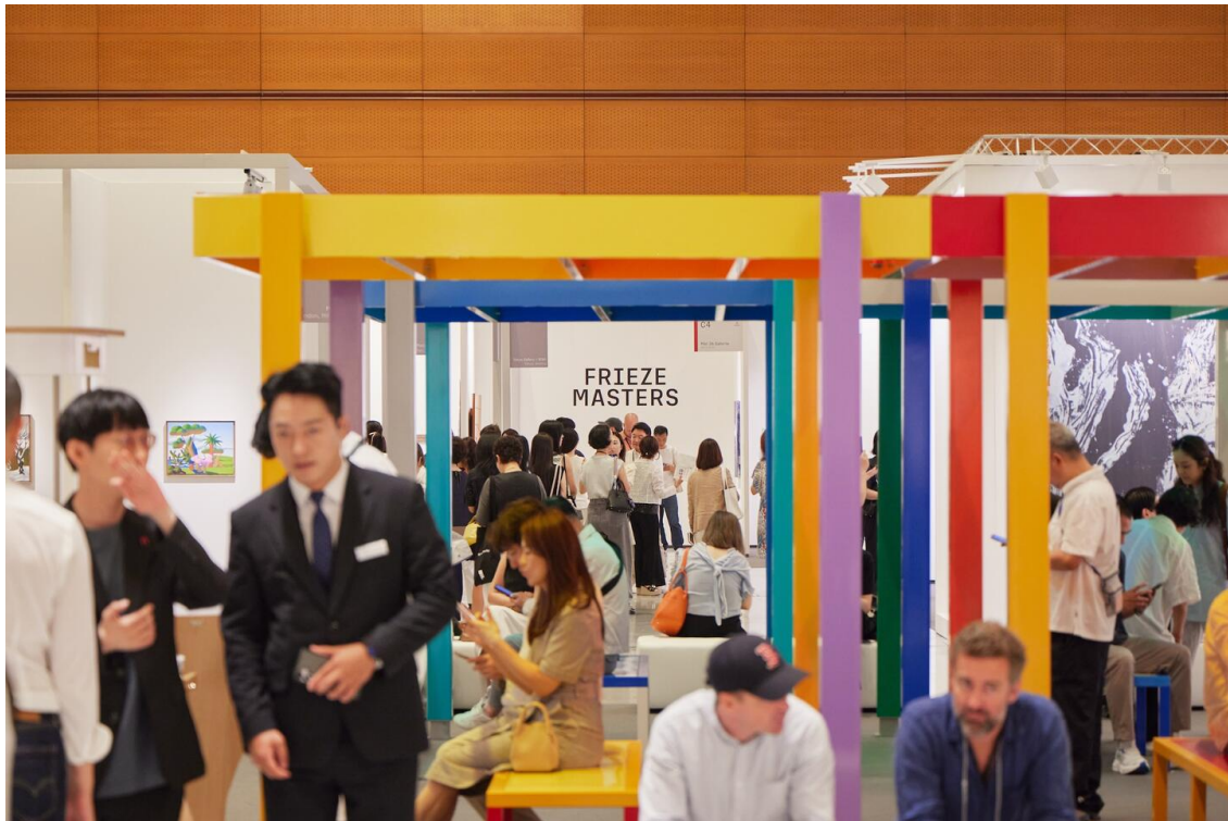
Liam Gillick, Frieze Seoul 2025.