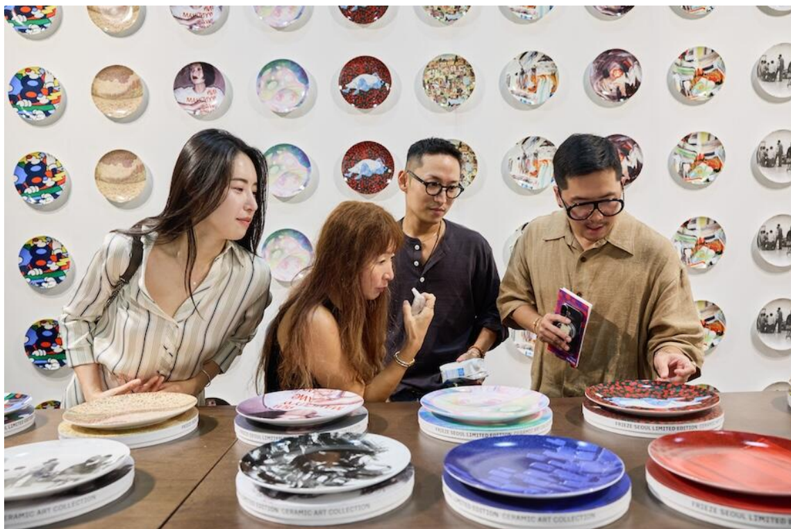
Print Bakery, Limited-Edition Ceramics at Frieze Seoul 2025.