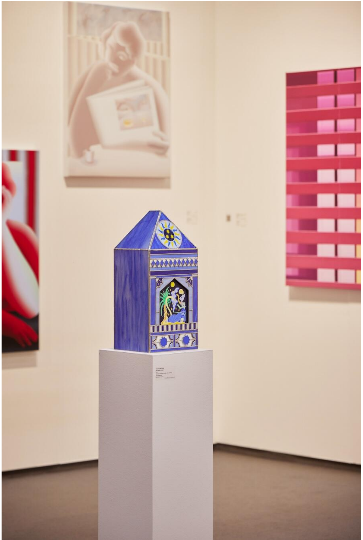
ThisWeekendRoom, Frieze Seoul 2025.