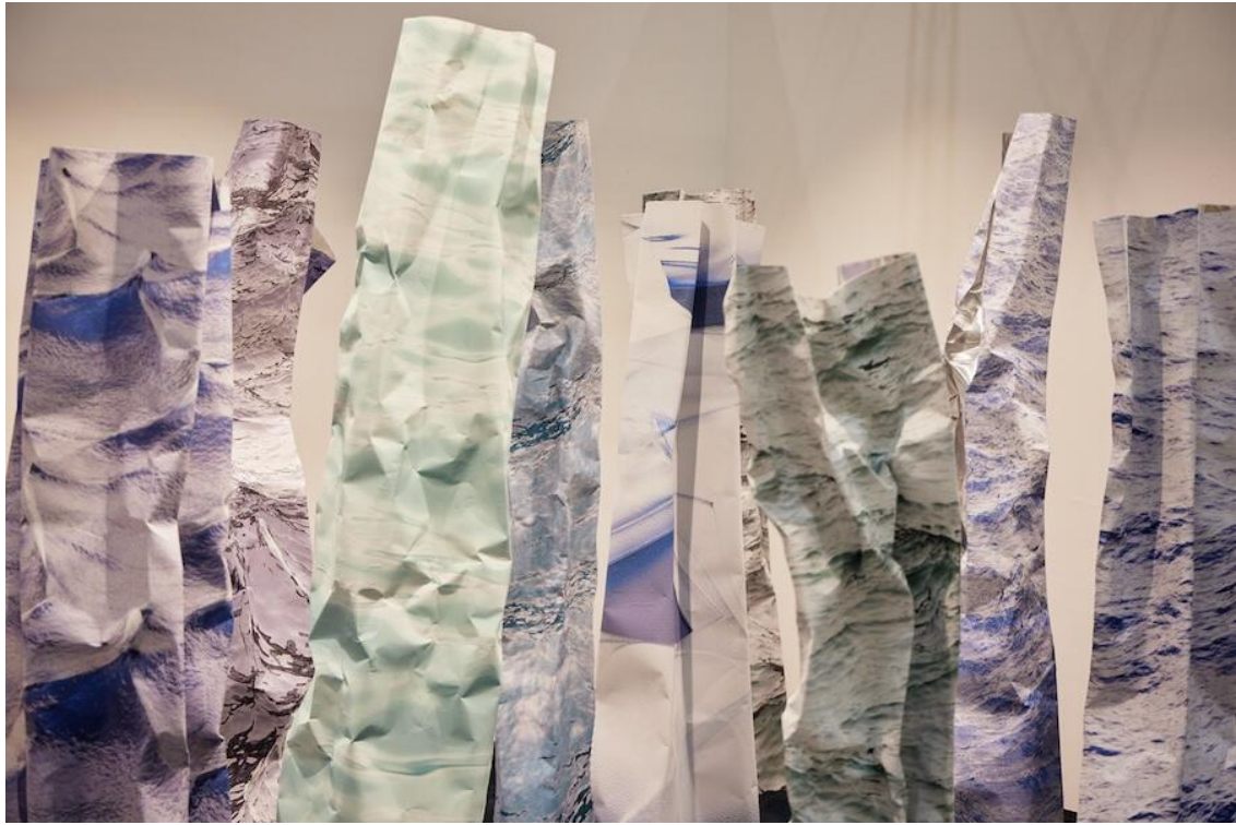
Gallery Planet, Focus Asia section at Frieze Seoul 2025.