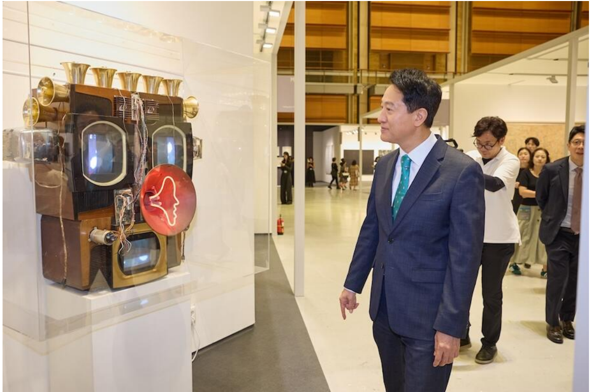
Oh Se-hoon, Mayor of Seoul at Frieze Seoul 2025.