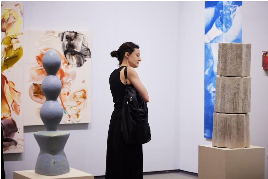
Takuro Someya Contemporary Art, Frieze Seoul 2025.