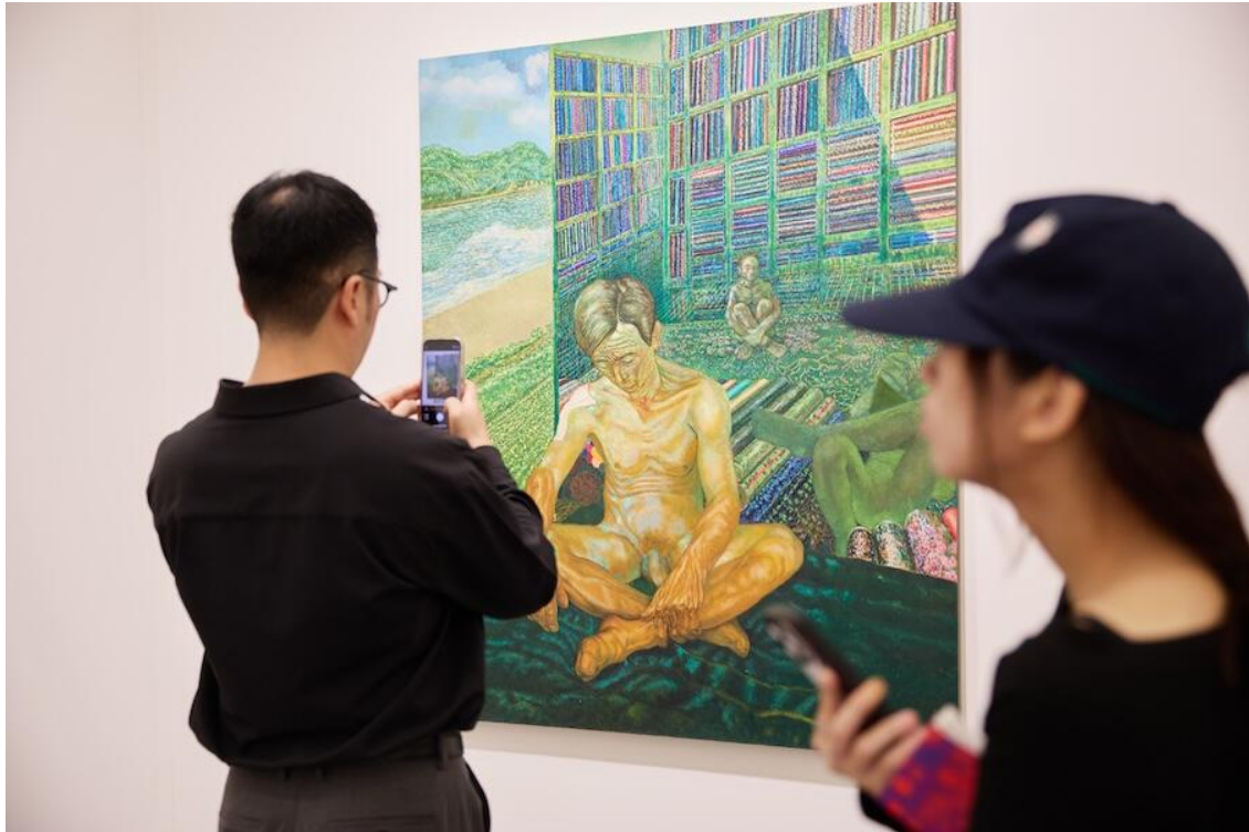
Gana Art, Frieze Masters section, Frieze Seoul 2025.