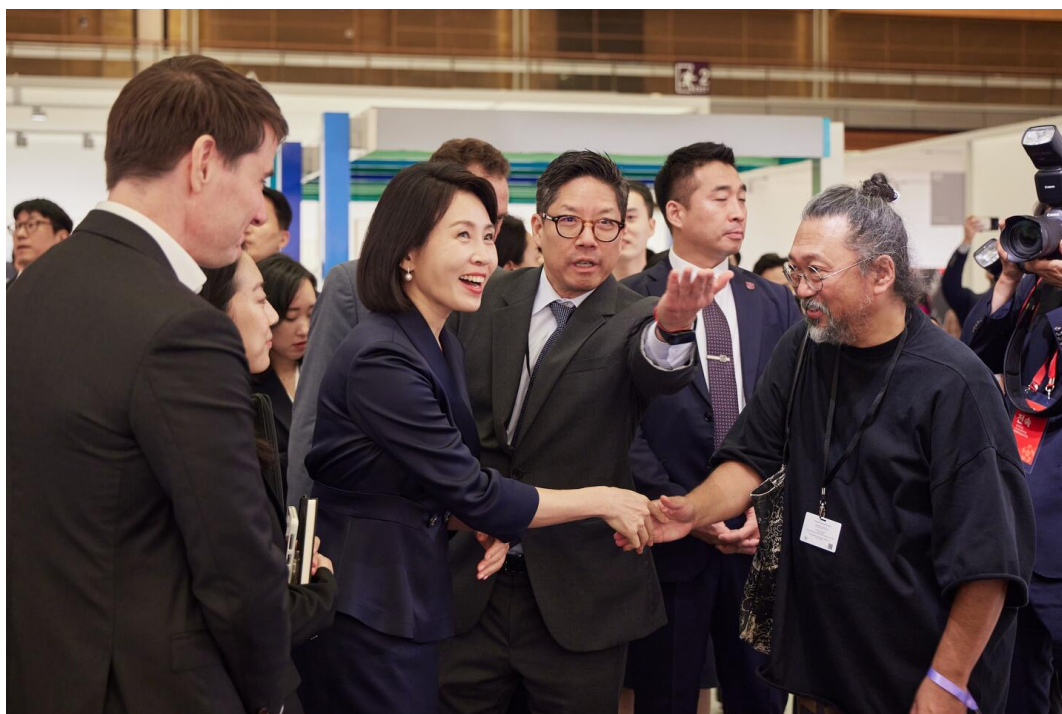
South Korea's First Lady Kim Hea Kyung meets artist Takashi Murakami.

Frieze Seoul 2025 features 120 galleries showcasing contemporary and historical artists from 30 countries across Asia and the rest of the world. Returning to COEX for its fourth edition from 3 - 6 September, this year's fair sees expanded Frieze Masters and Focus Asia sections, plus performances in the LIVE programme and activations across the Korean capital. Check out this guide to having a perfect day at Frieze Seoul 2025, and meanwhile here are some highlights from the fair so far, including an unexpected visit by South Korea's First Lady, Kim Hea Kyung.