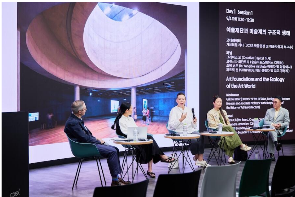
Frieze Talks programme presented in partnership with Kiaf SEOUL and KAMS, Frieze Seoul 2025.