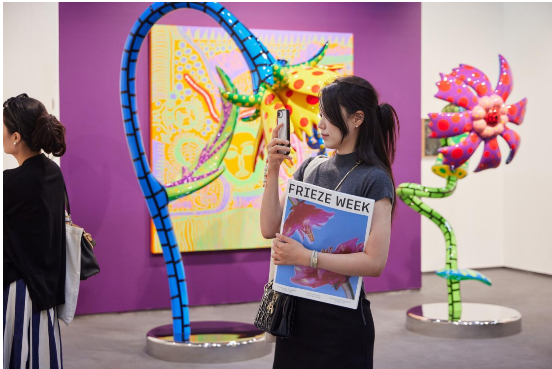
Frieze Seoul 2025.