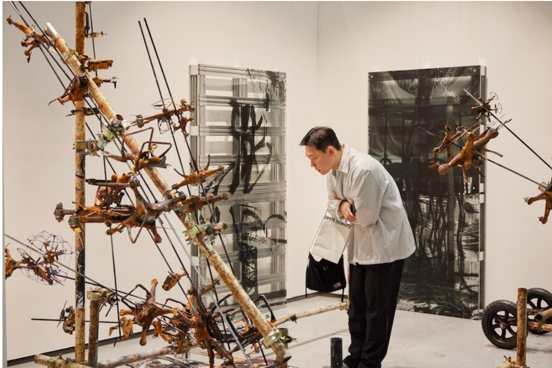
sangheut, Focus Asia section, Frieze Seoul 2025.