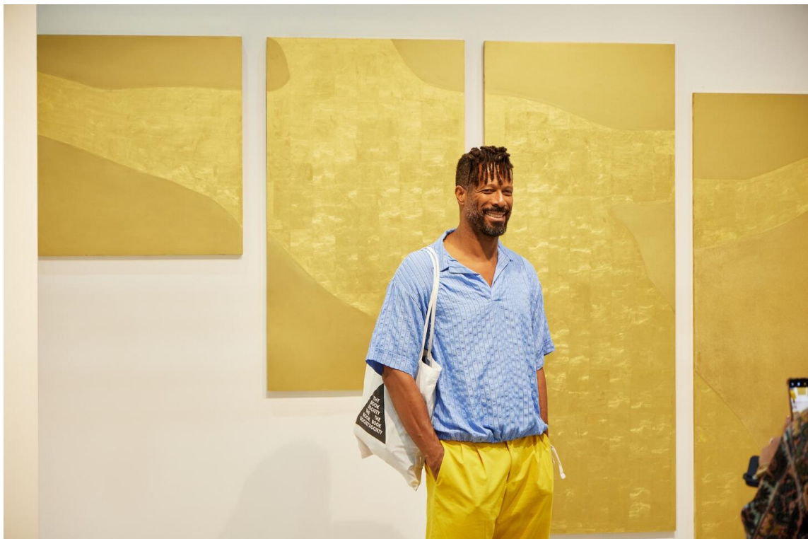
The Breeder, Frieze Seoul 2025.