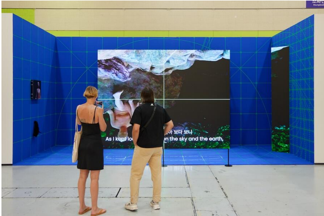
Im Youngzoo, Frieze Seoul Artist Award 2025 commission, Frieze Seoul 2025.