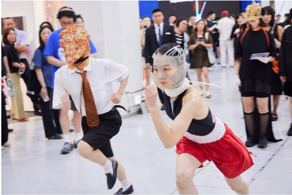
Yagwang, Raw Proof: Echo, Frieze LIVE 2025 in partnership with Art Sonje Center.