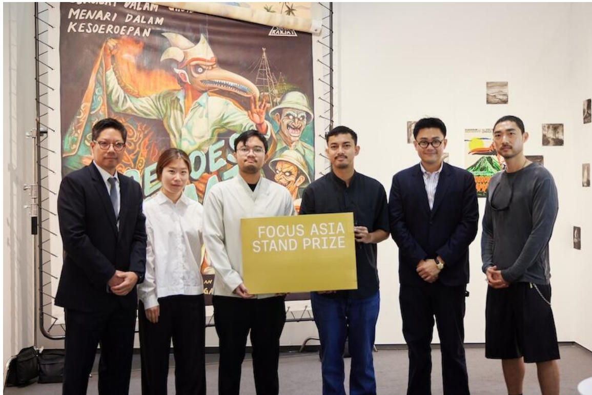
Kohesi Initiatives, winner of the 2025 Focus Asia Stand Prize, Frieze Seoul 2025.