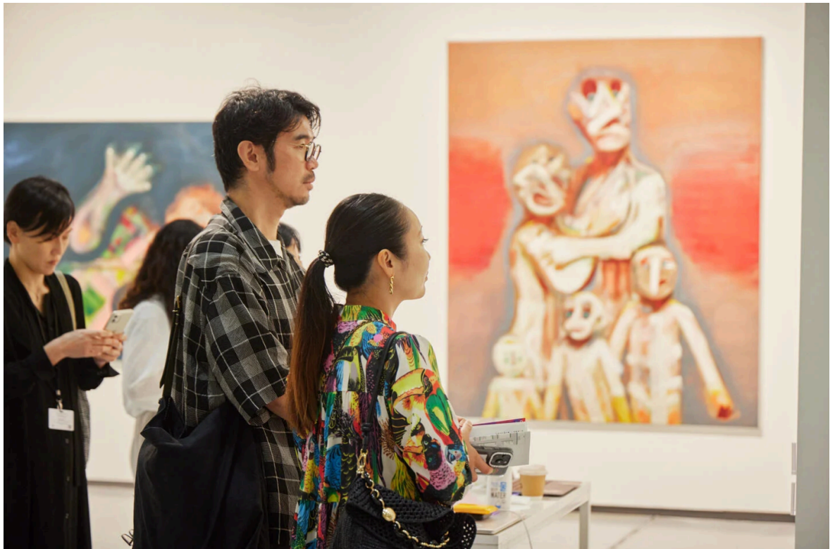
Frieze Seoul 2025.