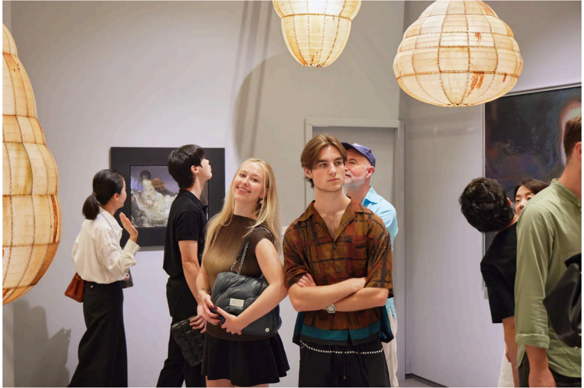
Gladstone Gallery, Frieze Seoul 2025.