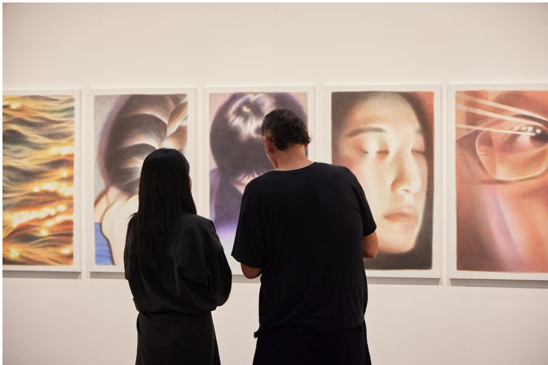
Frieze Seoul 2025.