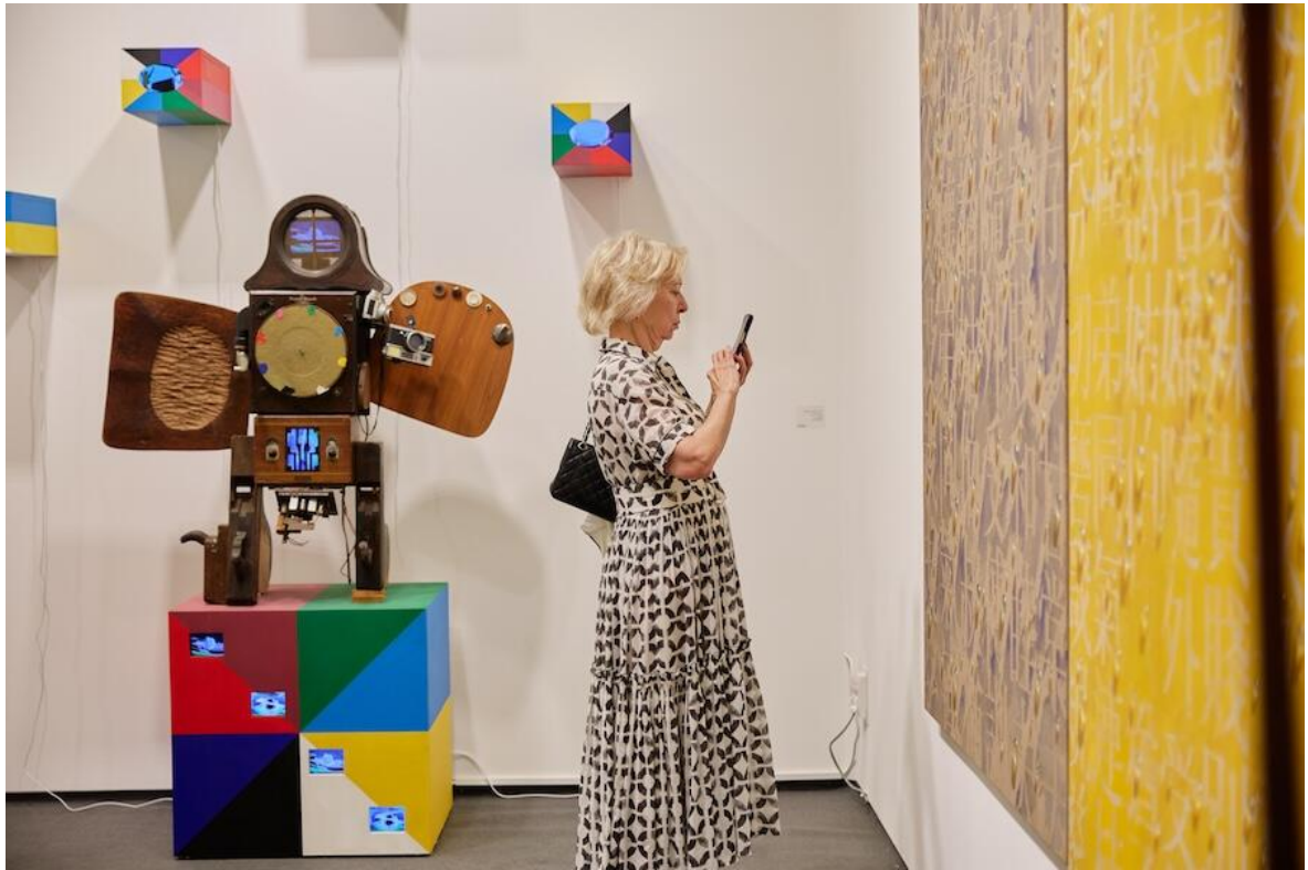
Bhak, Frieze Masters section, Frieze Seoul 2025.