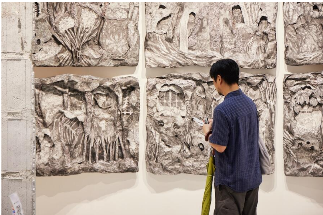
drawingRoom, Focus Asia section, Frieze Seoul 2025.